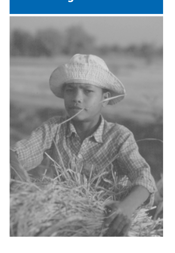
Chapter 2 Combating Poverty and Hunger