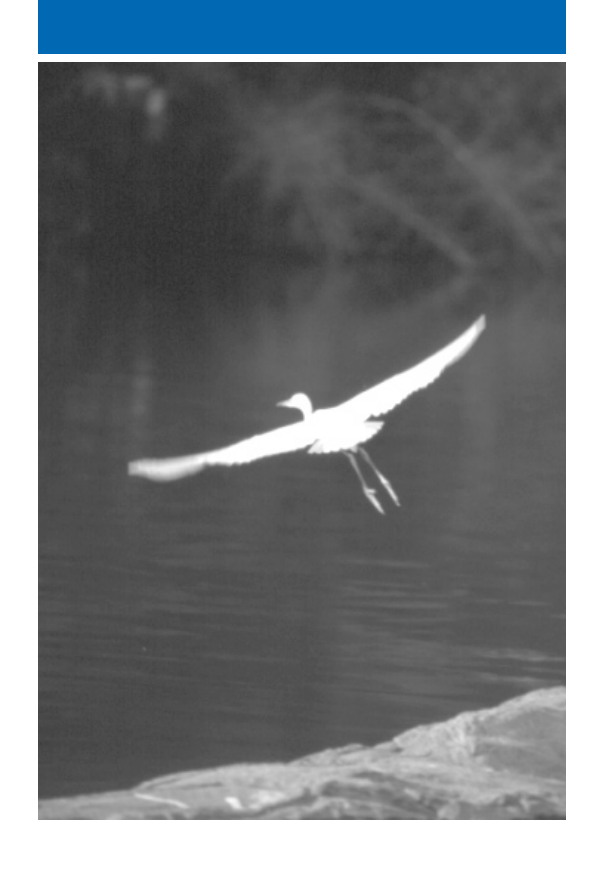
Chapter 5 Sustaining the Viability and Biodiversity of Ecosystems